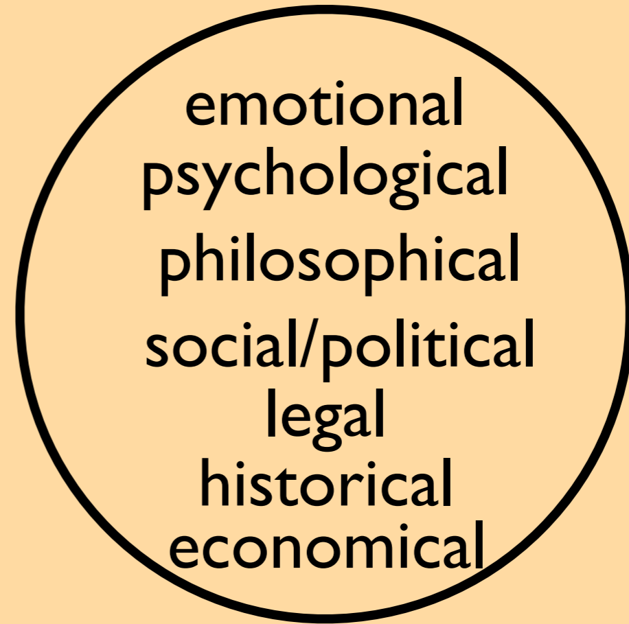
Other areas of life